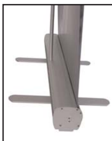
Twin feet UB191 and UB193